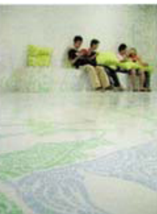
I This page Interior design in Hong Kong and London (Black), Interior design for megArt Store (Blue) | O pposite page Chinese! It's Chinese exhibition (Red), Untitled, interior design for The Rom With a view gallery (Blue)